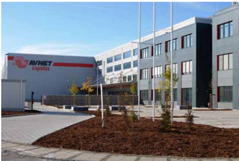
Avnet's new automated warehouse in Poing, Germany.

Just as we are encouraged to give back to our communities through charitable causes, our company supports our right to be involved in the political process. We must keep in mind, however, that we may only participate in such activities on our own time and at our own expense. We must never use Avnet property, facilities, time or funds for political activities. Similarly, you should never expect to be reimbursed—directly or indirectly—for a political contribution. If you have any questions, you should seek guidance from the legal department.