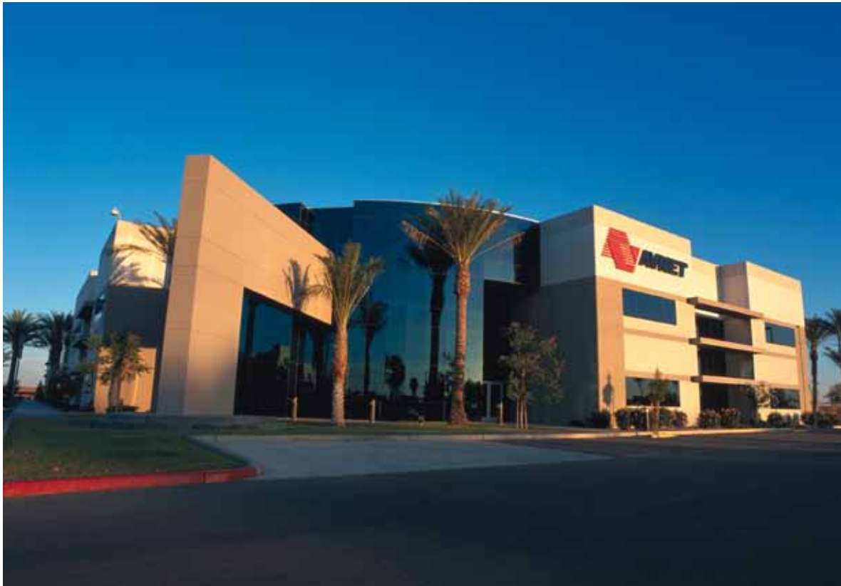
Avnet established its corporate headquarters in Phoenix, Arizona, in 1998.