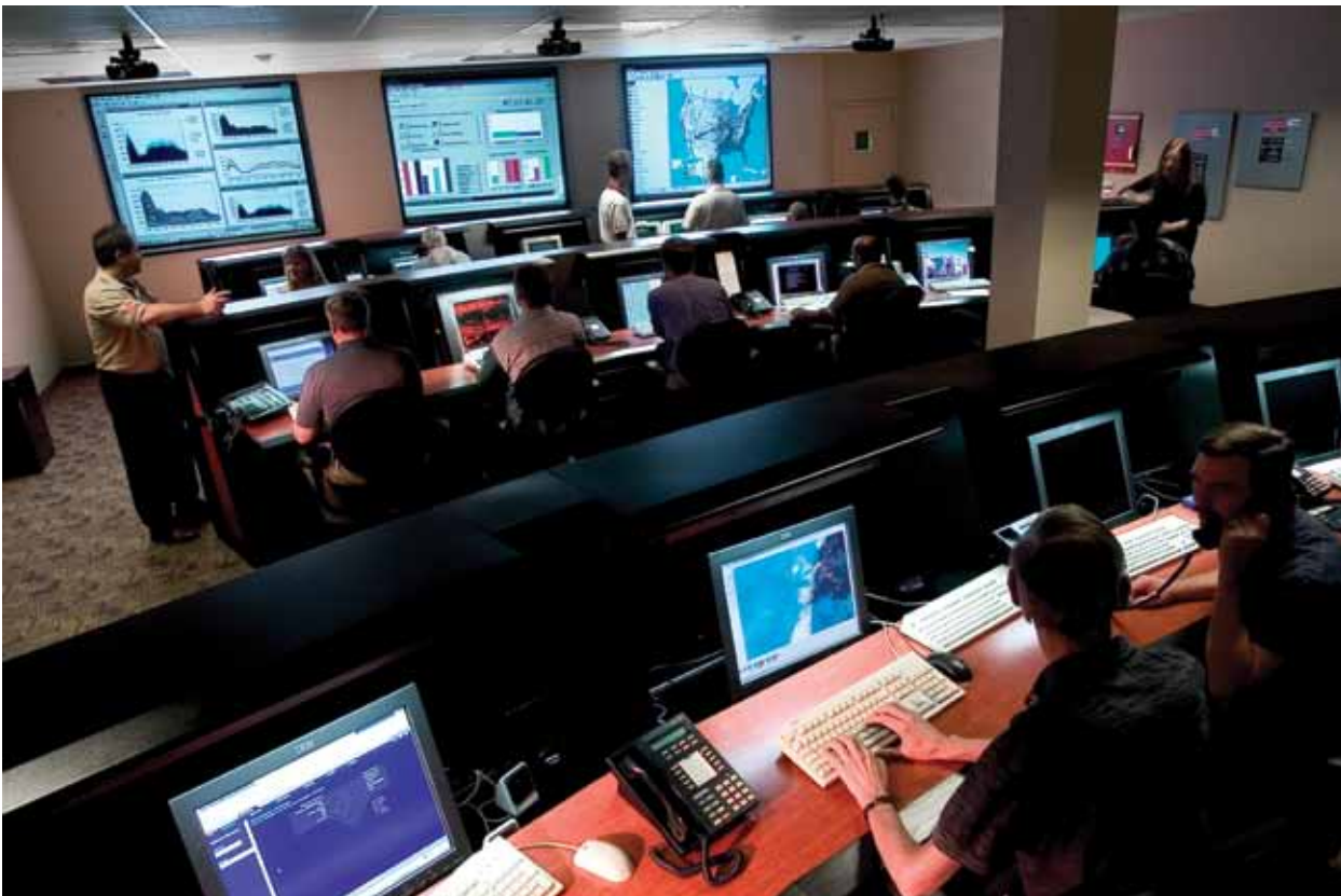
The global IT control room in Chandler, Arizona, is the heart of our communications, data storage and business activities with customers and suppliers.

Those of us whose duties involve international operations must be familiar with the relevant export and import laws and regulations that apply to our jobs. We must also familiarize ourselves with our company’s global trade compliance policies, and comply with them. Avnet’s policies governing global trade compliance are located on the intranet . Export and import laws and regulations can be complex; when in doubt, contact the legal department.