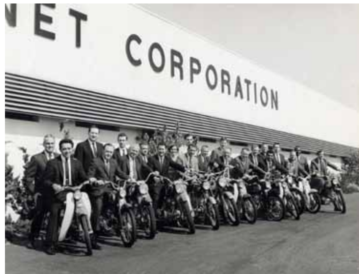
Avnet's Los Angeles and Orange County, California, teams rally for a sales promotion in 1968.

To maintain our integrity, it is important for us to have clear, consistent communications with the public about Avnet's financial status and plans. Our interactions with members of the news media and investment community must accurately reflect our company's goals and condition. Therefore, you must never make public statements on behalf of Avnet unless you have been authorized to do so. If you receive a request from an investor, security analyst, press or other key public contact—whether formally or informally—refer the individual to the investor relations or public relations departments. Requests from government officials or attorneys should be referred to the legal department.