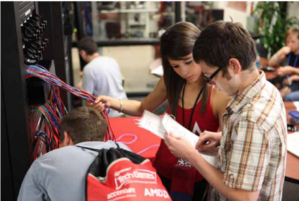
College students compete in the Avnet Tech Games.

The following sections describe some common situations that may create a conflict of interest. Please keep in mind that these are general examples. They are not the only possible conflicts you may encounter.