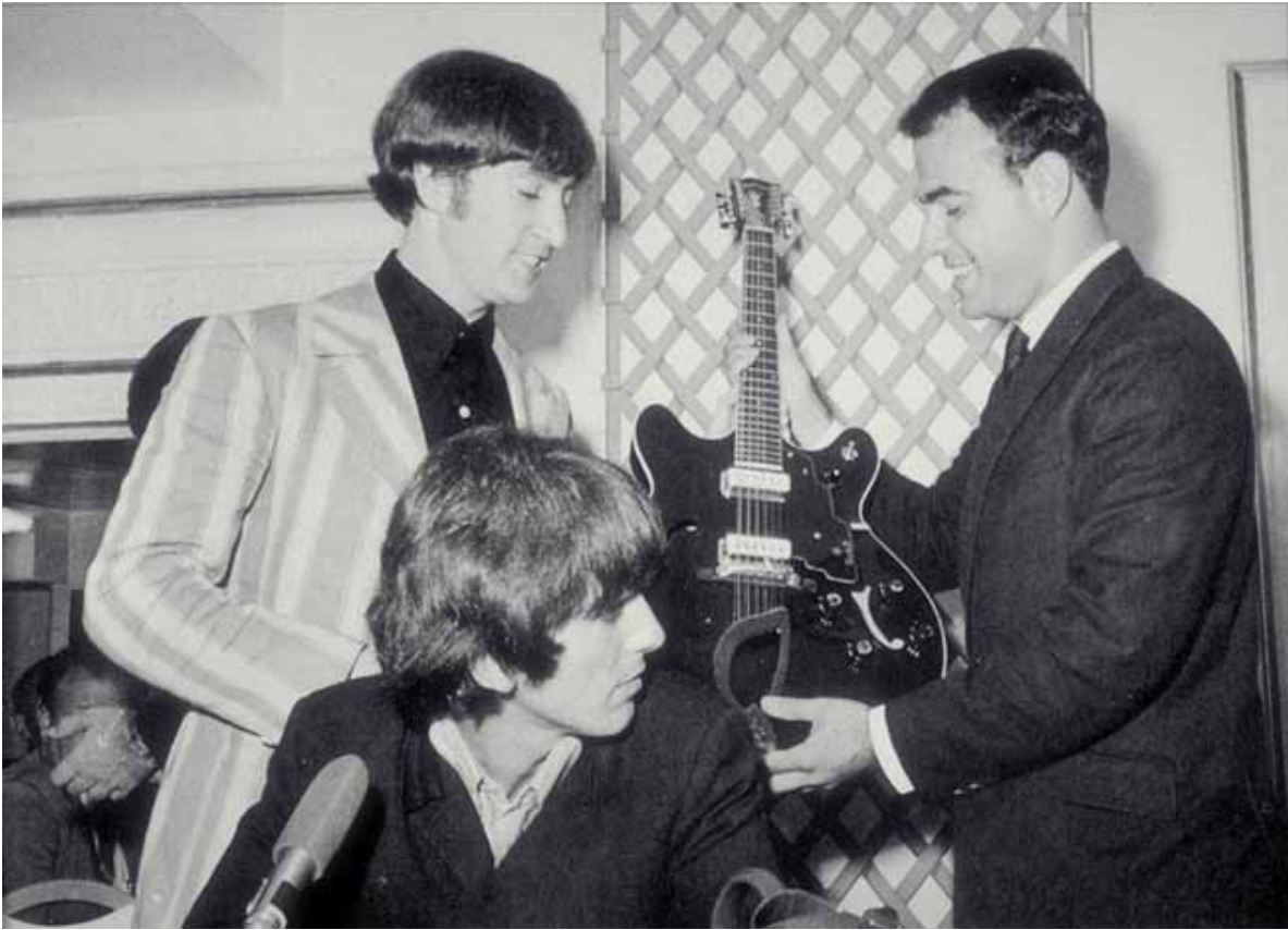
Avnet acquired Guild Musical Instruments in 1965, which led to Avnet presenting a Guild Starfire 12 to the Beatles' John Lennon and George Harrison.

interest, regardless of its significance, which could affect—or appear to affect—our decision making on behalf of Avnet. There is a blanket exception for small amounts of stocks, bonds or other securities issued by a publicly held corporation. In this case, a “small amount” means less than one percent of the value of the company. Otherwise, the corporate ethics and compliance committee must approve exceptions in writing.