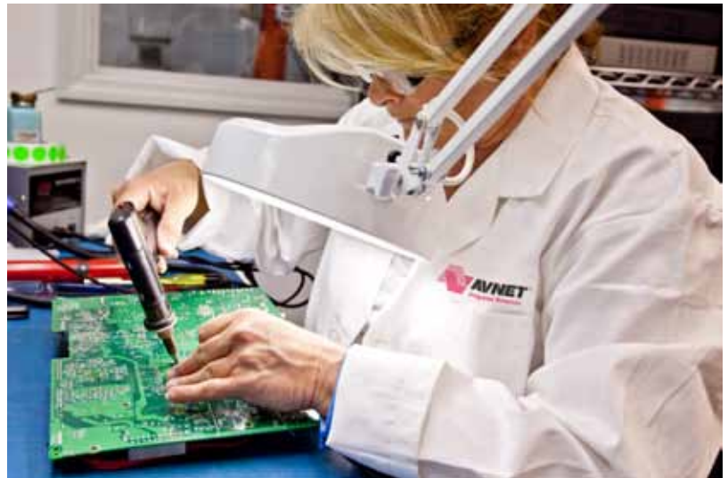
Repair technician at Avnet Integrated Resources' Columbus, Ohio, facility, which serves the cable TV industry.

It is important that we protect the confidentiality of this information at all times. Confidential information should be shared only with fellow employees whose jobs require them to have access to it, or as otherwise required by law. We must not attempt to use confidential and proprietary information for personal gain, nor should we disclose confidential, sensitive or non-public information to people outside our company. This includes being diligent and mindful of who may be listening when discussing such information in public places like trains, airports, restaurants or breakrooms.