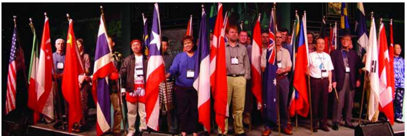
Flag ceremony opens the Avnet Global Managers Meeting in 2000 where 700 leaders from around the world gathered.

In addition to export and import laws, we must be mindful of trade sanctions that apply to our work at Avnet. Sanctions imposed by the United States and other countries may restrict or prohibit dealings with certain countries—or individuals who live in or originate from those countries. Activities that may be restricted include: