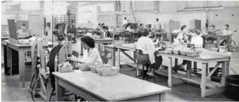
An Avnet connector assembly operation, 1959.

At Avnet, we believe we work best in an atmosphere of fairness, cooperation and equal opportunity. As employees, we are thus committed to respecting the dignity of each individual. All of us must conduct ourselves in a mature, responsible, professional and respectful manner. In addition, we all must share the responsibility for maintaining a safe, respectful and productive workplace.