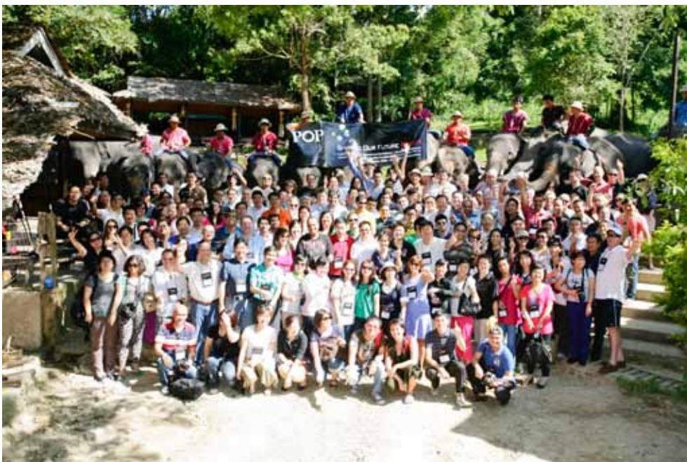
Avnet Technology Solutions Asia leadership conference to build on their knowledge, culture and teamwork.

Avnet must operate in full compliance with the laws, rules and regulations of the geographies in which we do business. Many such laws are complex and may change over time, varying between countries. If you have questions about a particular law or regulation, or how it applies to your work at Avnet, please contact your manager or the legal department.